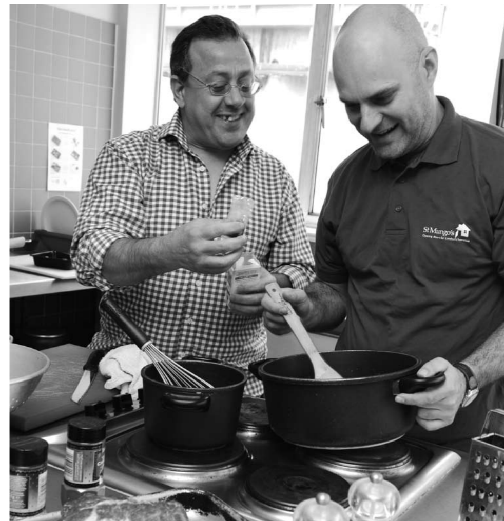
Hostels that are doing well benefit from progression accommodation such as 'learner flats' within the hostel site