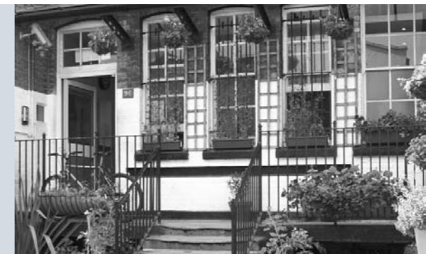
The research shows activities such as our Putting Down Roots gardening programme really do help clients progress