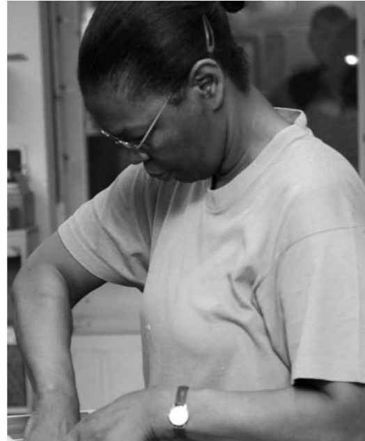
A client takes part in our Wood Workshop training