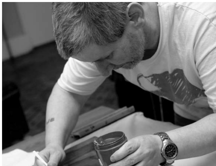
The most successful hostels have funding that enables a good programme of on-site activities, outings and life skills