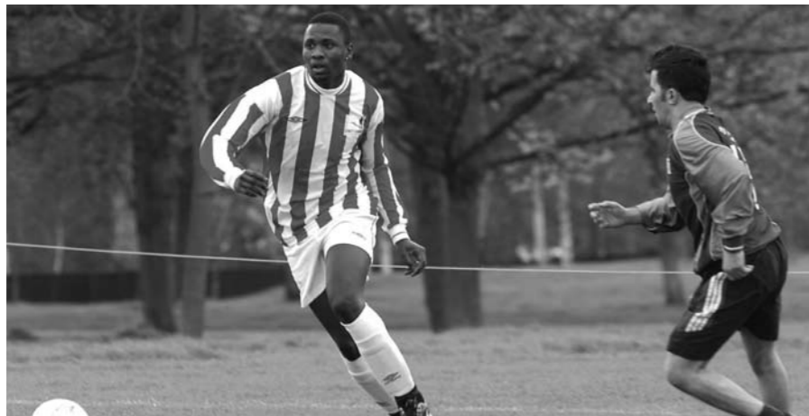
Benefit was seen across all client groups. The research also demonstrated the benefit of targeted support to minority groups, as with our Portuguese clients

However, the ethnic group doing best overall is Portuguese residents of a large hostel, despite the highest drugs use problems of the study; on average these clients progress 2.4 points on the Star between readings. Within the Triangle research, this was attributed primarily to the fact that there were two dedicated workers for Portuguese clients in the hostel. Indications are that this is having a significant effect on this particular group of clients and indicates a similar service response could be trialled for other groups eg women.